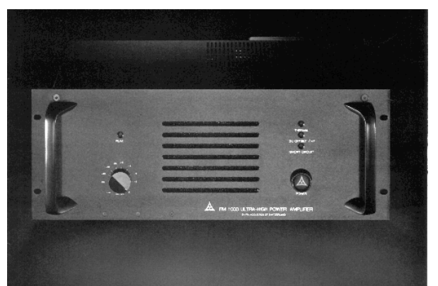
FM 1000 Ultra-High Power Amplifier, the absolute State of the Art