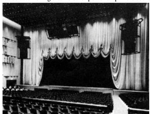
Interior view of Sun Plaza concert hall, Tokyo

More than 20'000 Watts of FM ACOUSTICS power amplifiers were acquired by the prestigious Sun Plaza Hall in Tokyo termed as Japan's premiere concert hall. As the amplifiers had to be located as close to the speakers as possible (which are suspended from the ceiling and lowered with lifts), special versions of FM 600A and FM 800A power amplifiers were manufactured for Sun Plaza: an additional 5-way cable is run from each amplifier to the control room where level display and indicators for each individual amplifier are located on a special display panel. This way the level fed to each amplifier can be monitored directly from the mixing desk. The amplifiers were installed directly above the speakers to minimise the distance to the speakers. Sun Plaza decided to install FM ACOUSTICS amplifiers after extensive comparisons. Before, various P.A. systems had been evaluated in controlled listening tests combined with measurements. Responsible for the sound at Sun Plaza are Messrs: A. Nakanishi, K. Hashimoto and Mr. Kimura. They mentioned that they selected FM ACOUSTICS power amplifiers because of their outstanding performance and remarked that the audible difference to other amplifiers was so astonishing that no other power amplifiers could