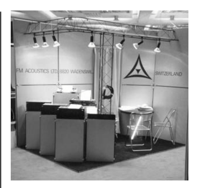
Booth of FM ACOUSTICS at London AES exhibition March 1987

The London AES exhibition was one of the most successful exhibitions ever. FM ACOUSTICS' booth designed and built this year again by Wemer Schnell Design Munich - was constantly crowded and it was often impossible to have enough time for everyone. A thanks to those who waited patiently and sometimes for hours! As expected there was keen interest in FM ACOUSTICS power amplifiers and the FM 236 family of linear-phase electronic crossovers, but the units that probably attracted the most interest were the FM 214/FM 216. Many producers, engineers and recording studios conveyed their appreciation for FM ACOUSTICS' quality standards. Major interest came from broadcasters from all over the world. There were many questions relating to the use of the FM 214 and FM 216 in CD transfer, applications in OB vans, in interfacing, for line driving in fixed as well as mobile installations. Great interest was also shown by record cutting studios and recording studios.